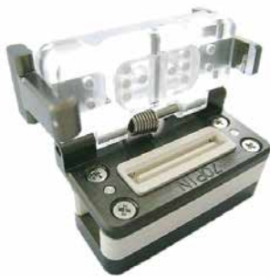
Single-site pogo socket Pitch: 0.4mm