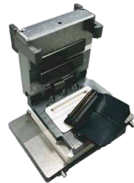
Dual-site pogo socket with fine pitch connector (DUT)