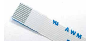
Gold Finger Device under Test