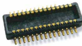
Fine Pitch Connector Device under Test